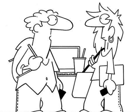
“I’m enrolling in seminary college so I can learn about miracles, like how to pay off my student loans.”