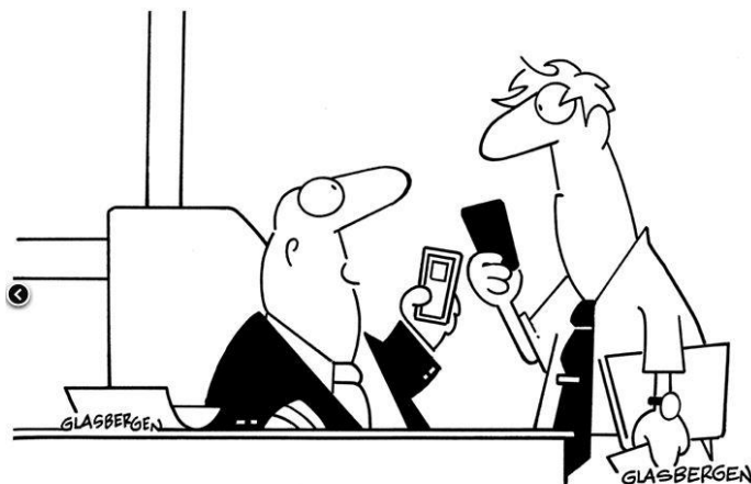
“Which weather app are you using? Mine is forecasting a plague of locusts and scattered showers of fire and brimstone.”